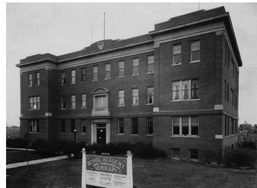
Bethel Academy and Theological Seminary, St. Paul, MN, in 1920.

Throughout the years, Bethel has remembered its rich heritage and held to the guiding principles of its founder while forging a Christ-led vision for the future.