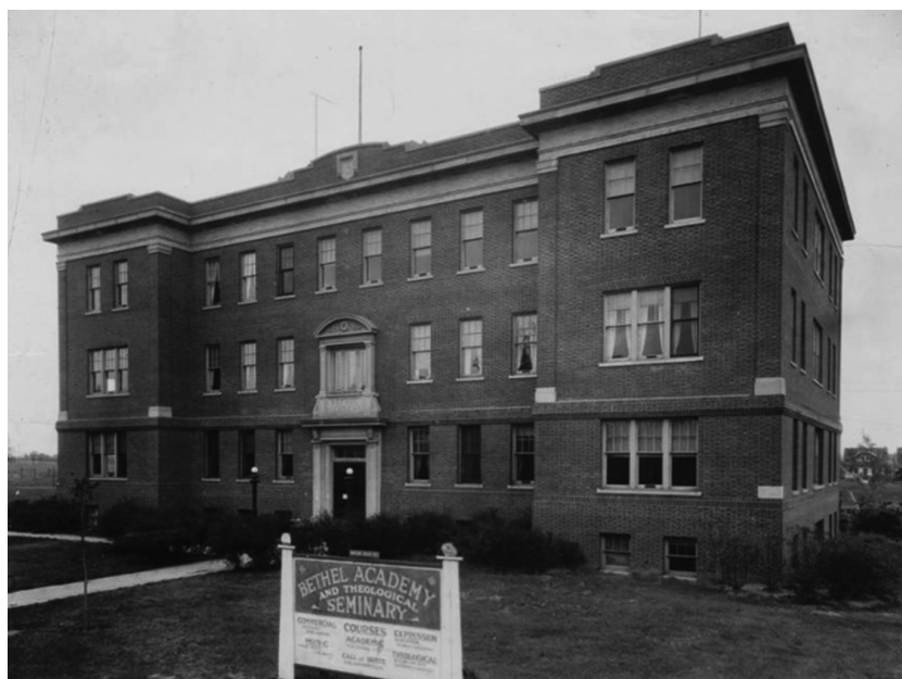
Bethel Academy and Theological Seminary, St. Paul, MN, in 1920.

Throughout the years, Bethel has remembered its rich heritage and held to the guiding principles of its founder while forging a Christ-led vision for the future.