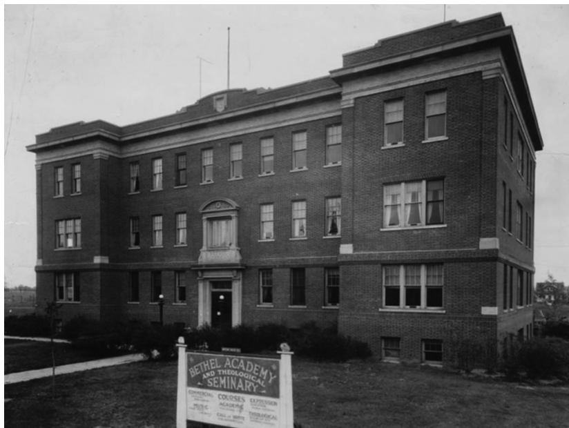
Bethel Academy and Theological Seminary, St. Paul, MN, in 1920.

Throughout the years, Bethel has remembered its rich heritage and held to the guiding principles of its founder while forging a Christ-led vision for the future.