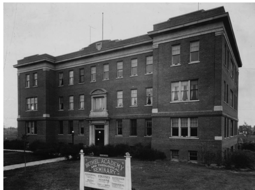
Bethel Academy and Theological Seminary, St. Paul, MN, in 1920.

Throughout the years, Bethel has remembered its rich heritage and held to the guiding principles of its founder while forging a Christ-led vision for the future.