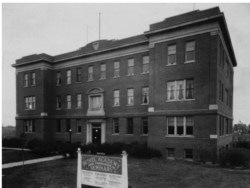
Bethel Academy and Theological Seminary, St. Paul, MN, in 1920.

Throughout the years, Bethel has remembered its rich heritage and held to the guiding principles of its founder while forging a Christ-led vision for the future.