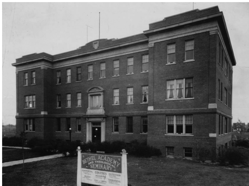
Bethel Academy and Theological Seminary, St. Paul, MN, in 1920.

Throughout the years, Bethel has remembered its rich heritage and held to the guiding principles of its founder while forging a Christ-led vision for the future.